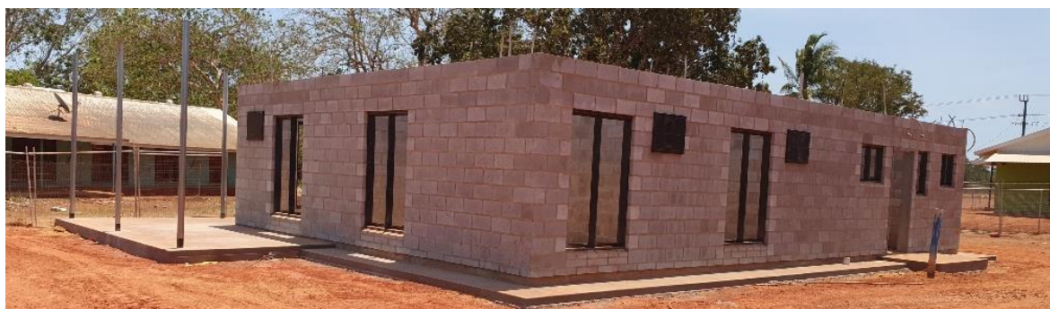
Construction photo: Maningrida - HomeBuild NT - construct 4 dwellings