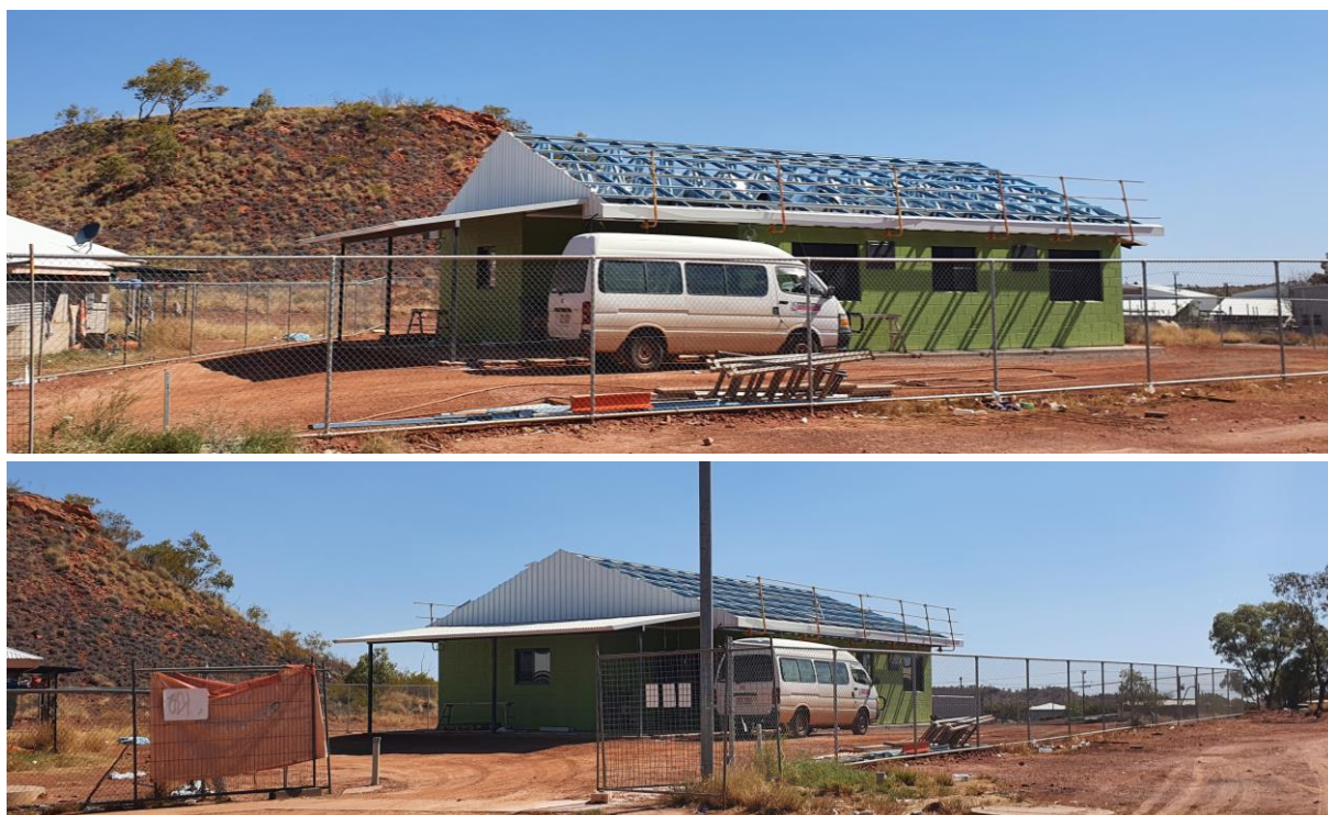
Construction photos: Tennant Creek - Community Living Areas - construct 5 dwellings - package 1