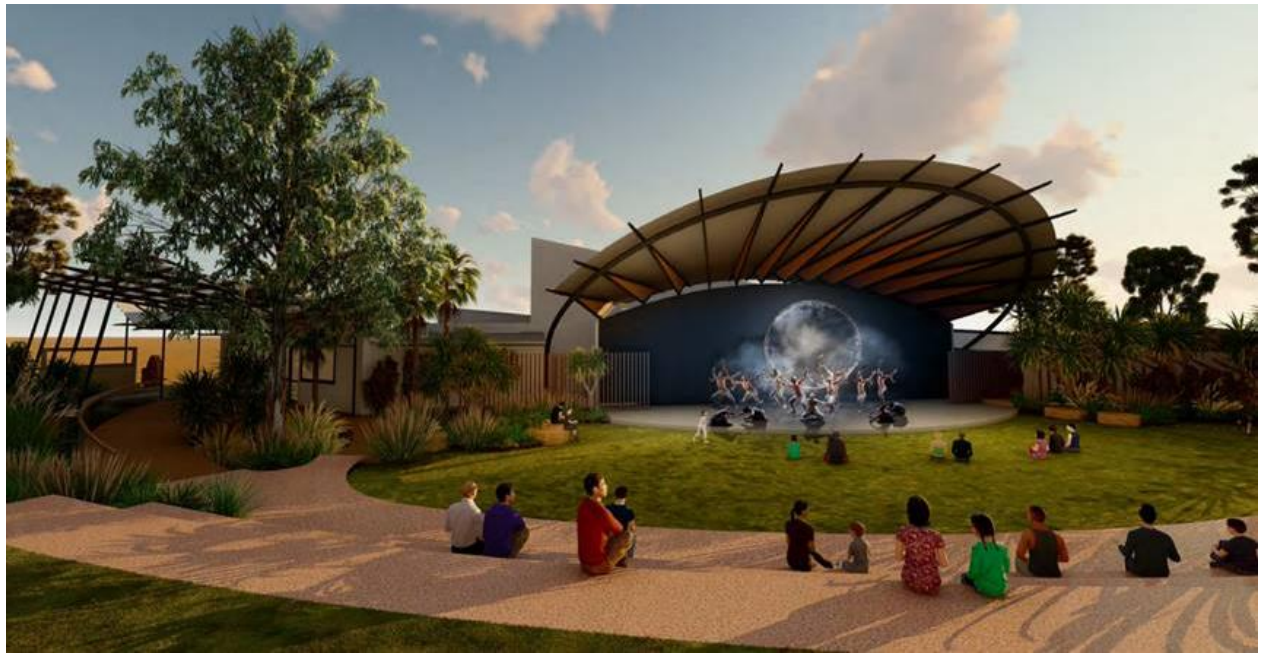
Concepts Katherine - Godinymayin Yijard Rivers Arts and Culture Centre - stage and amphitheatre