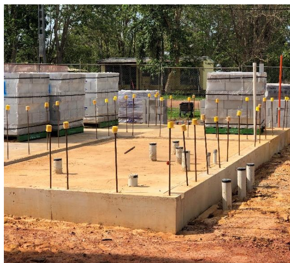
Construction photos: Pirlangimpi - HomeBuild NT - construct 20 dwellings