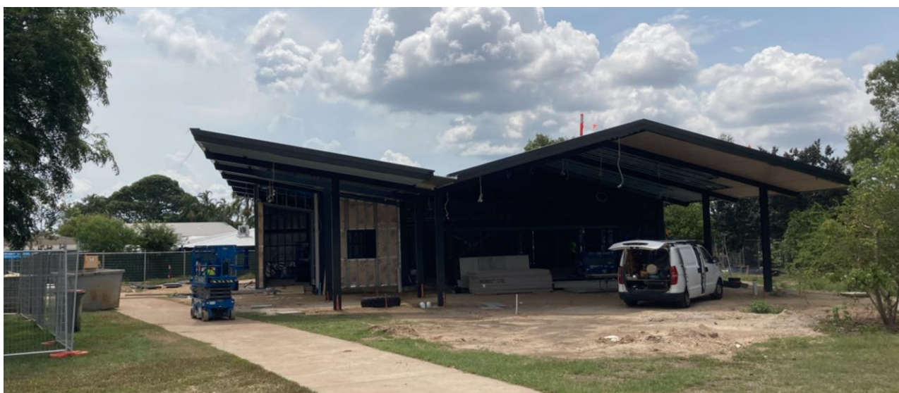
Construction photo: Gray Community Hall