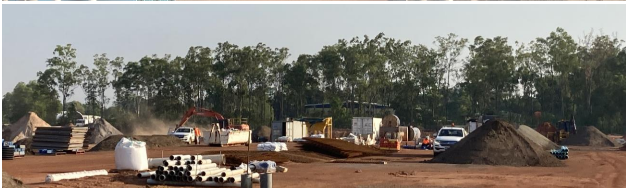
Photos: Berrimah - 1 Boulter Road - Mirawood Estate - subdivision to create 37 lots including 1 public open space lot