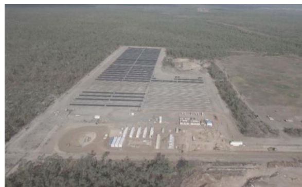
Construction photos: Jabiru Futures - hybrid power station