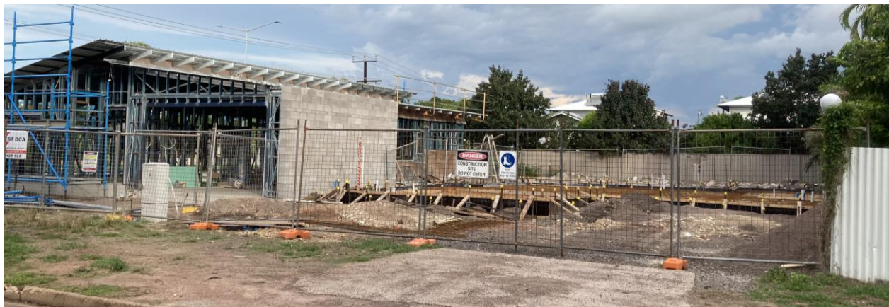
Construction photo: Fannie Bay - Christie Street - 3 detached single dwellings