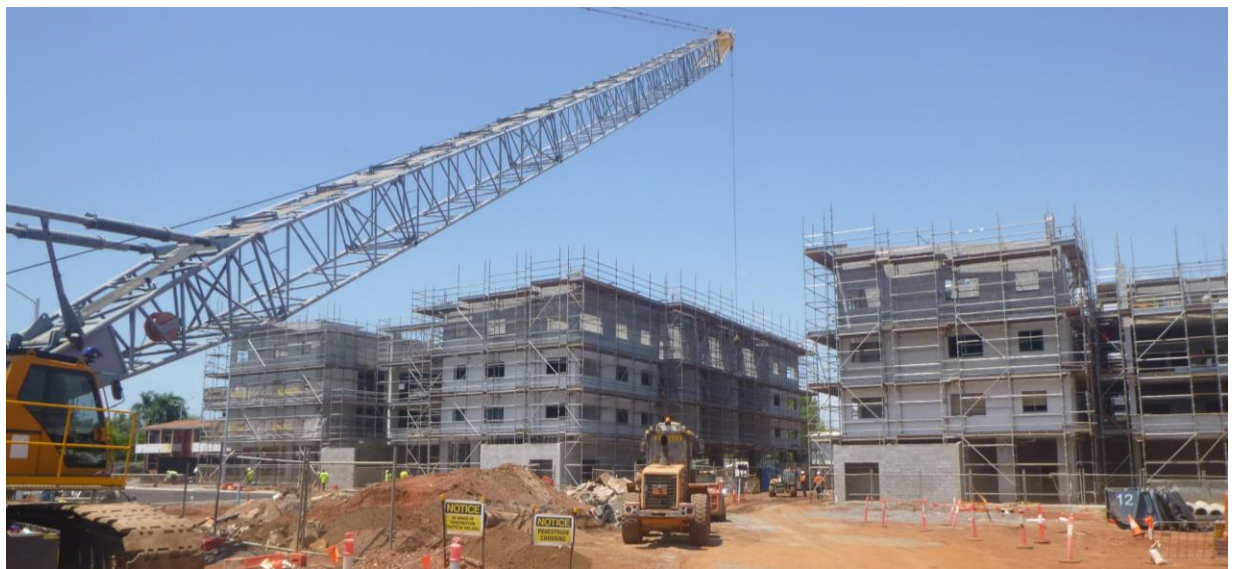
Construction photos: Nightcliff - John Stokes Square redevelopment - residential precinct construction