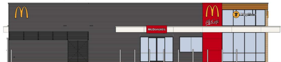
Concept of proposed: Northcrest - Julius Street - fast food outlet