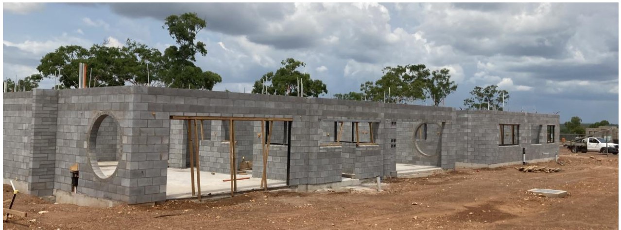
Construction photos: Gunn - 10 Ridge Street - Child Care Centre