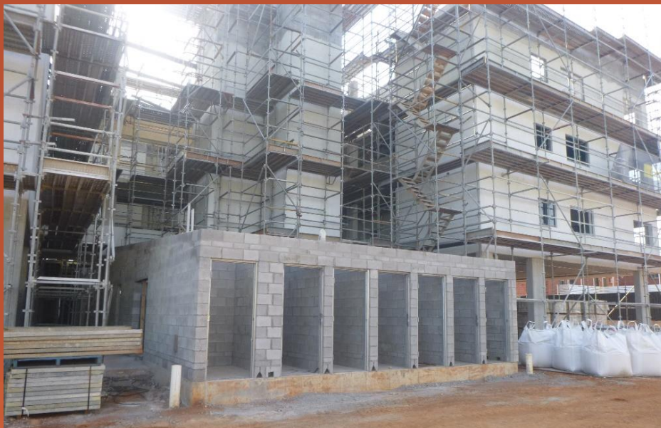
Nightcliff - John Stokes Square redevelopment - residential precinct construction

Construction Snapshot is published by the Department of Infrastructure, Planning and Logistics on a quarterly basis. The information provides an overview of the Northern Territory's construction activity for major works over $500 000. It reflects work that is both currently under construction and potential future construction-related work as at 1 October 2021.