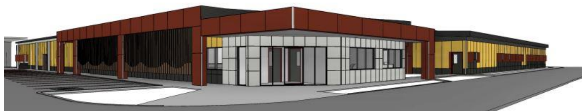
Concept: Berrimah Farm redevelopment - Makagon Road - science services building