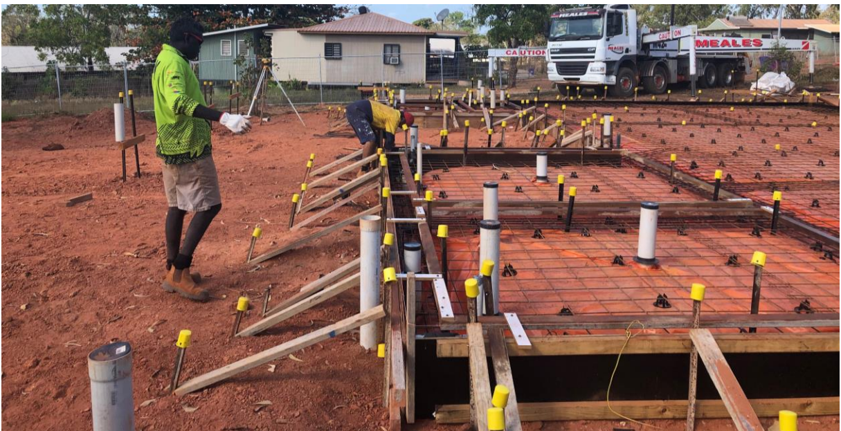
Construction photos: Galiwinku - HomeBuild NT and Room to Breathe - construct 87 dwellings and 17 extensions