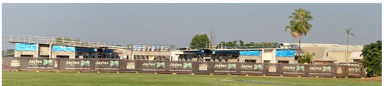
Construction photo: Berrimah - Haileybury Rendall School - international student boarding facilities