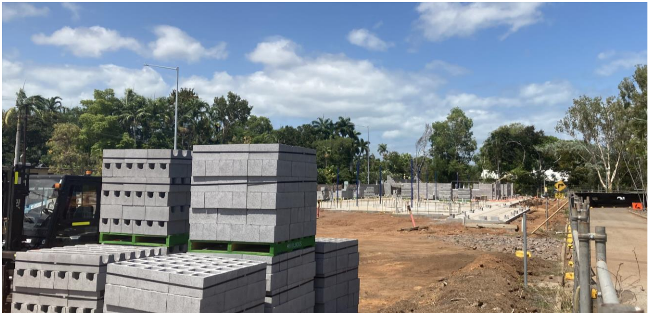
Construction photo: CDU Casuarina Precinct - new childcare centre