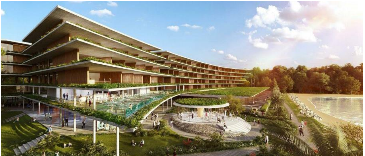
Concept images: Little Mindil Resort - hotel in 2 by 6 storey and 3 by 1 storey buildings