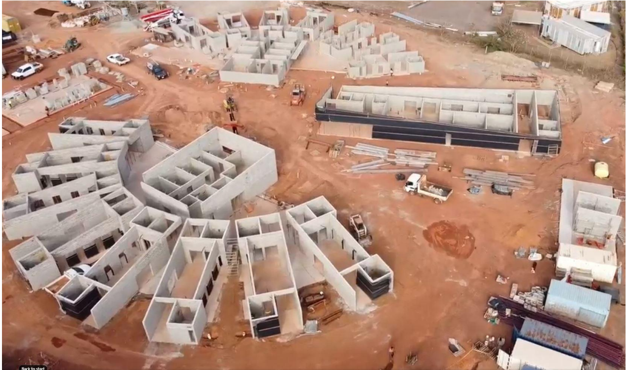
Construction photos: Nhulunbuy residential aged care centre – 32 bed facility with palliative care, additional bathrooms, 4 renal chairs and a sorry business space