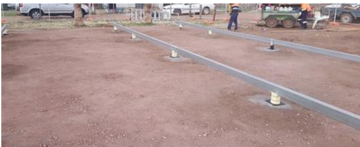
Construction photo: Atitjere - NPRH NT - construct 2 dwellings