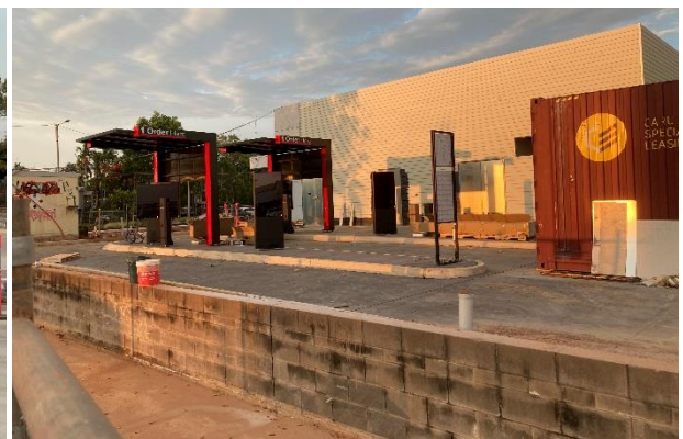
Construction photos: Casuarina - Bradshaw Terrace - fast food restaurant with drive through facility