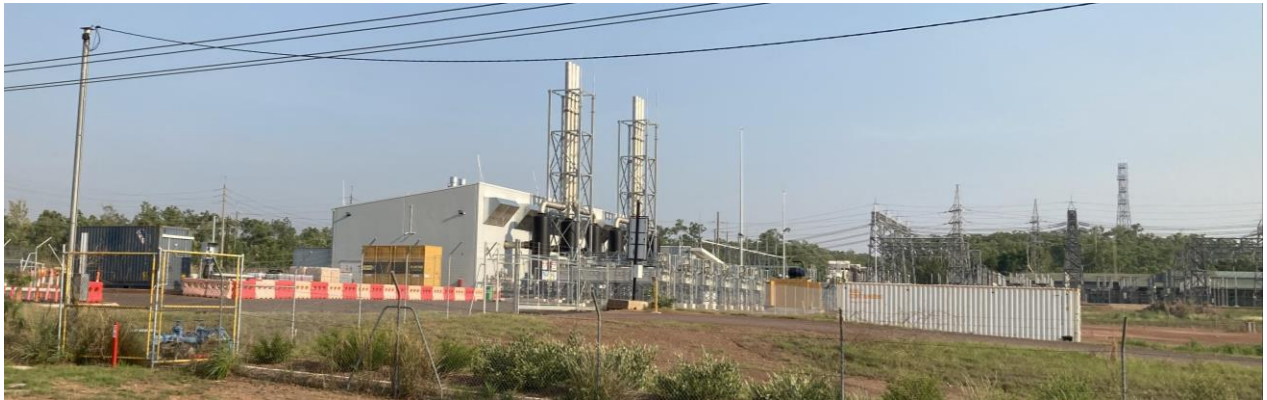
Construction photo: Wishart - 31 Wishart Road - Power Station including five gas-fired generators and ancillary structures, administration building and warehouse