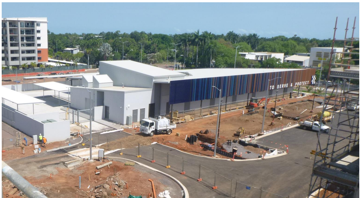
Construction photo: Nightcliff - 47 Progress drive - John Stokes Square redevelopment - new police station