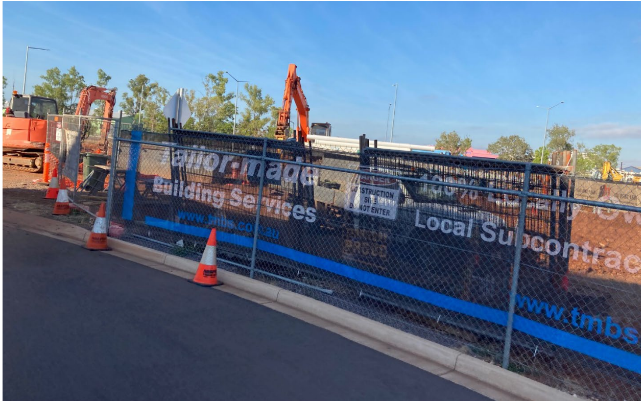
Construction photo: Yarrowonga - 8 Pierssene Road - warehouse and showroom sales