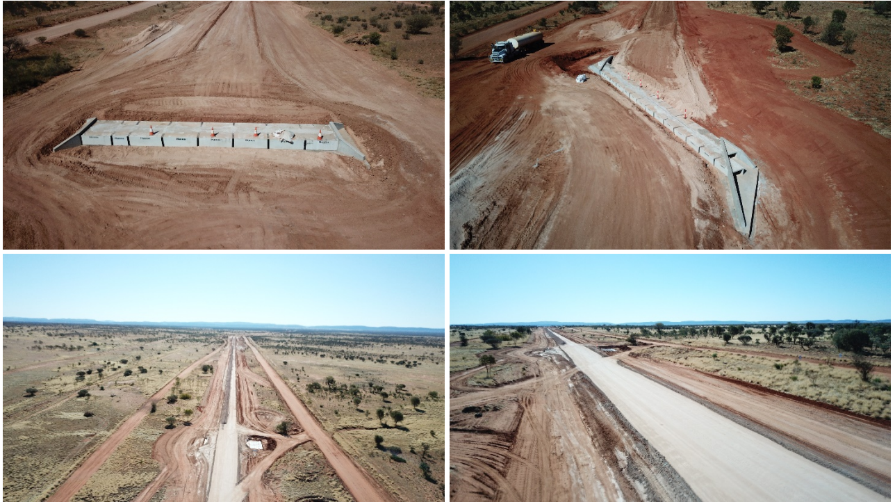
Construction photos: Roads of Strategic Importance – Maryvale Road upgrade to seal chainage 10 - 20 km