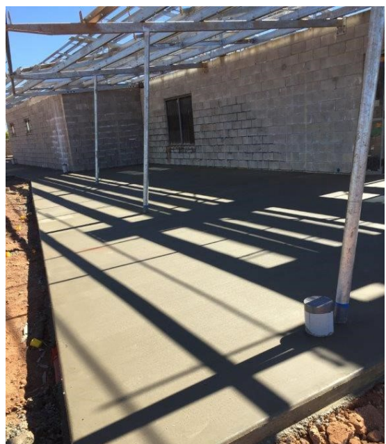
Construction photo: Ngukurr - construction of a new Police Station, houses and Visiting Officer Quarters