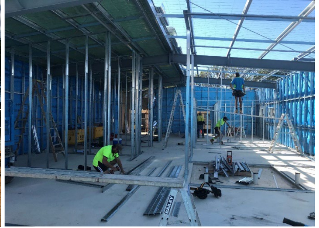
Construction photos: Katherine Hospital - construct specialist suites