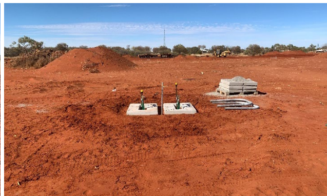
Construction photos: Arlparra (Utopia) - subdivision civil works and services construction