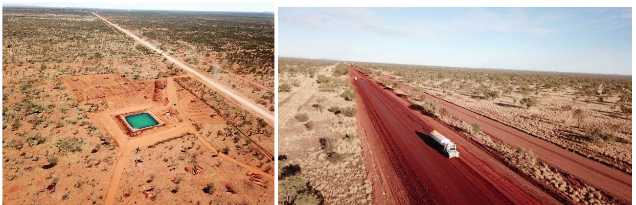
Construction photos: Outback Way – Plenty Highway upgrade to seal chainage 167.11 - 170.15 km and 209 - 224 km