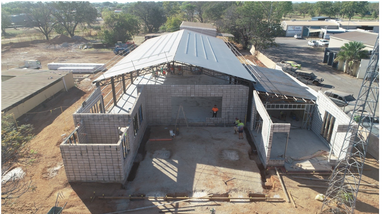
Construction photos: Mimi Aboriginal Art and Craft - construction upgrades