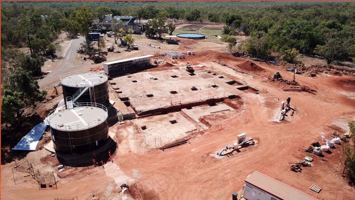
Katherine - concrete foundations and civil works at the Katherine water treatment plant

Construction Snapshot is published by the Department of Infrastructure, Planning and Logistics on a quarterly basis. The information provides an overview of the Northern Territory's construction activity for major works over $500 000. It reflects work that is both currently under construction and potential future construction-related work as at 1 July 2021.