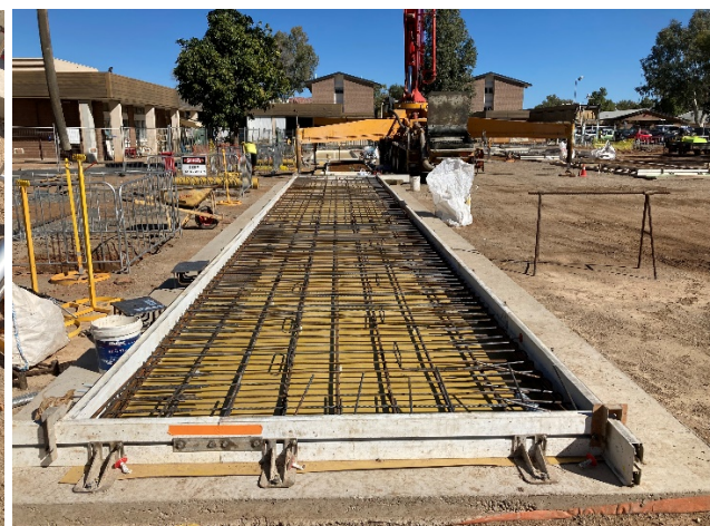
Construction photos: Alice Springs Hospital - design and construct multi-storey carpark