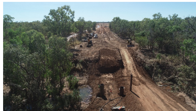
Construction photos: Katherine - Emungalan Road - Leight Creek Bridge construction