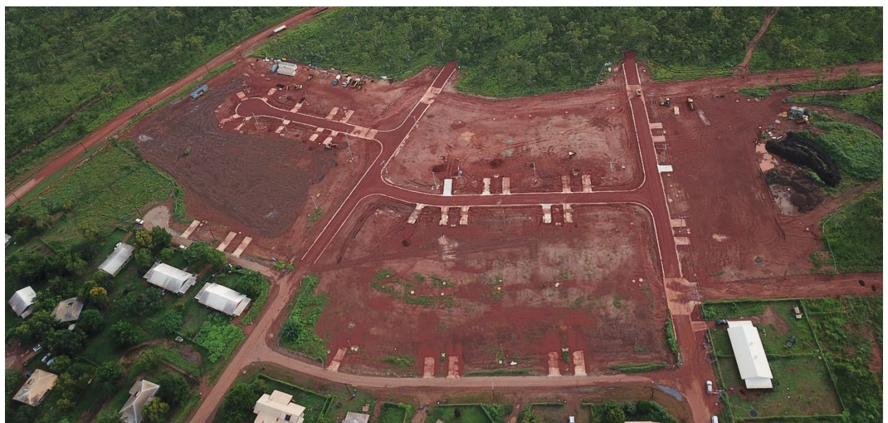
Construction photo: Maningrida subdivision - drainage remediation works