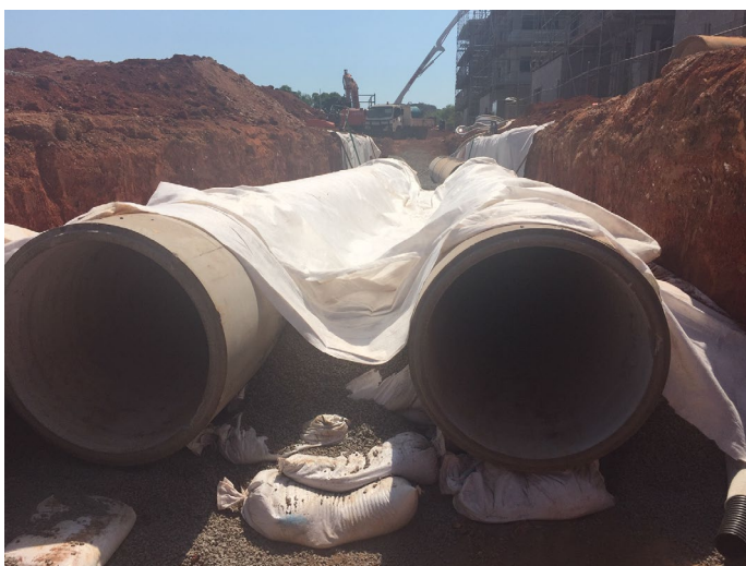
Construction photo: Nightcliff - John Stokes Square redevelopment - residential precinct construction