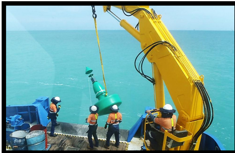
Photo: Installation of marine navigation aids in Aspley Strait

http://www.nt.gov.au/infrastructure/publications/snapshot/index.shtml