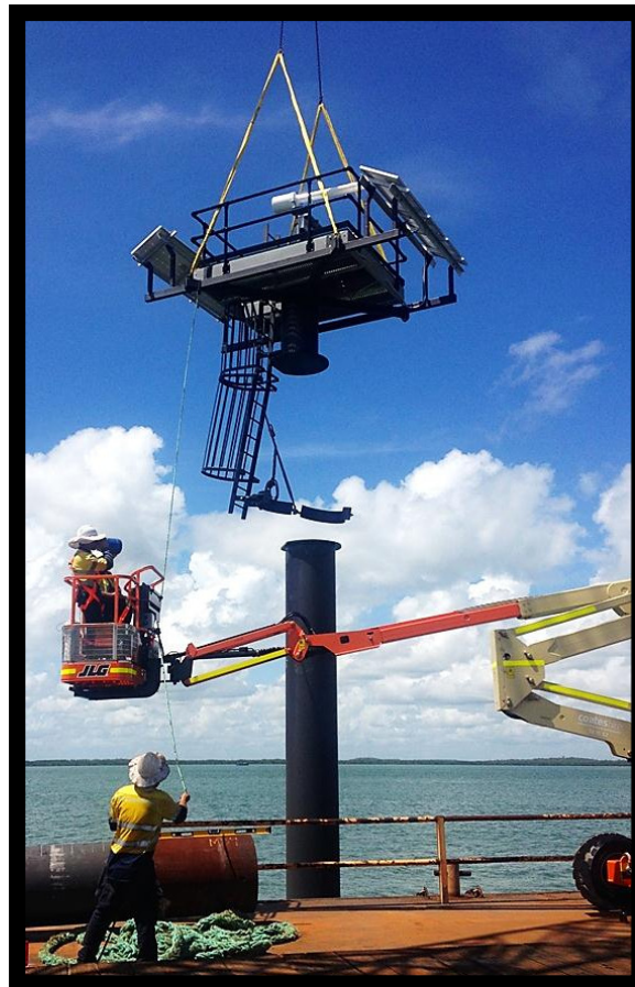
Photo: Marine Supply Base installation of navigation aid