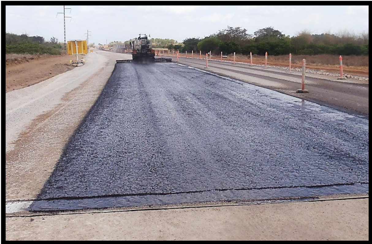
Photo: Arnhem Highway upgrade