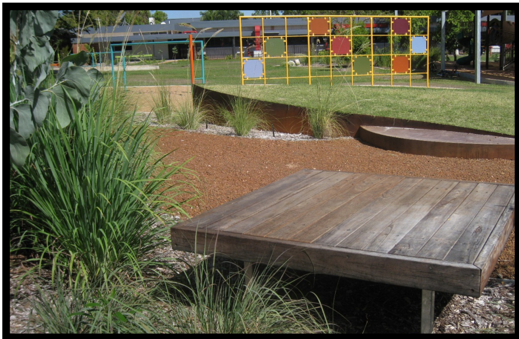
Photo: Milner Primary School landscape works after