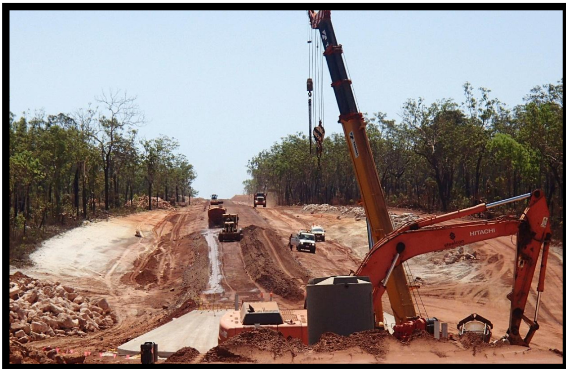
Photo: Central Arnhem Road - Goyder River