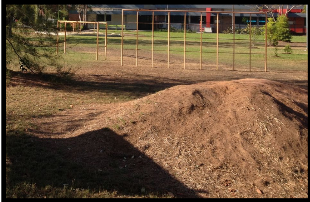
Photo: Milner Primary School landscape works before