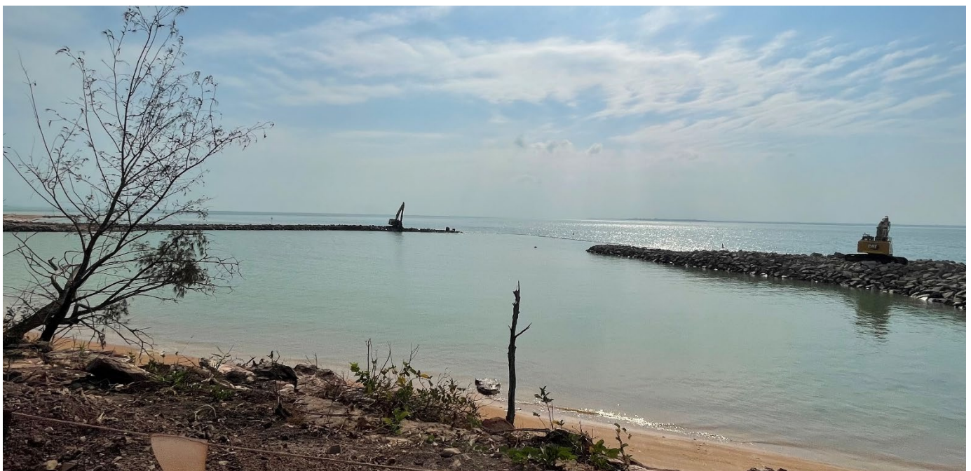
Above: Construction progress on the breakwaters for the new marine facilities in July 2024.

Use the QR code to subscribe for updates on the Mandorah Marine Facilities project