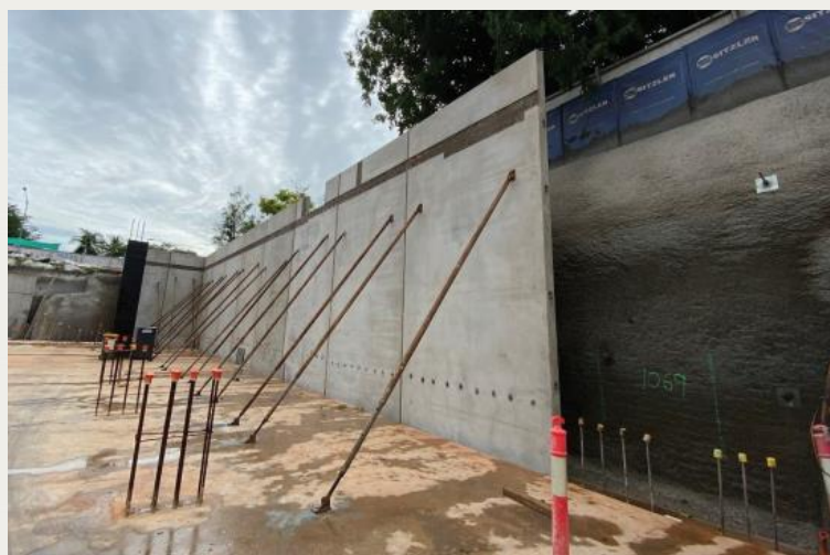
Above: Precast concrete panels being installed – March 2024.

There are 166 basement panels in total, with approximately 550 panels erected throughout the structure, requiring an expected 137 trailer loads to be trucked into the site.