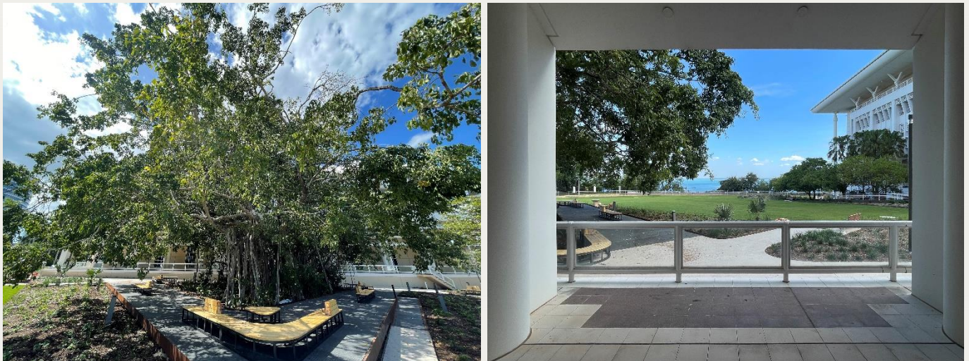
Above: Seating around the Banyan Tree and overlooking Liberty Square from Supreme Court

The Liberty Square Revitalisation Project is anticipated to be open to the public in early July. The raised deck to the banyan tree, porcellanite cladding to walls both sides of The Esplanade, paths, turf and planting is 100% complete. Finishing touches will include the installation of lighting and Mr Fejo's artwork with interpretive signage to follow.