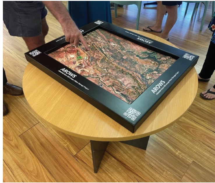
Pictured: 3D model of AROWS project site