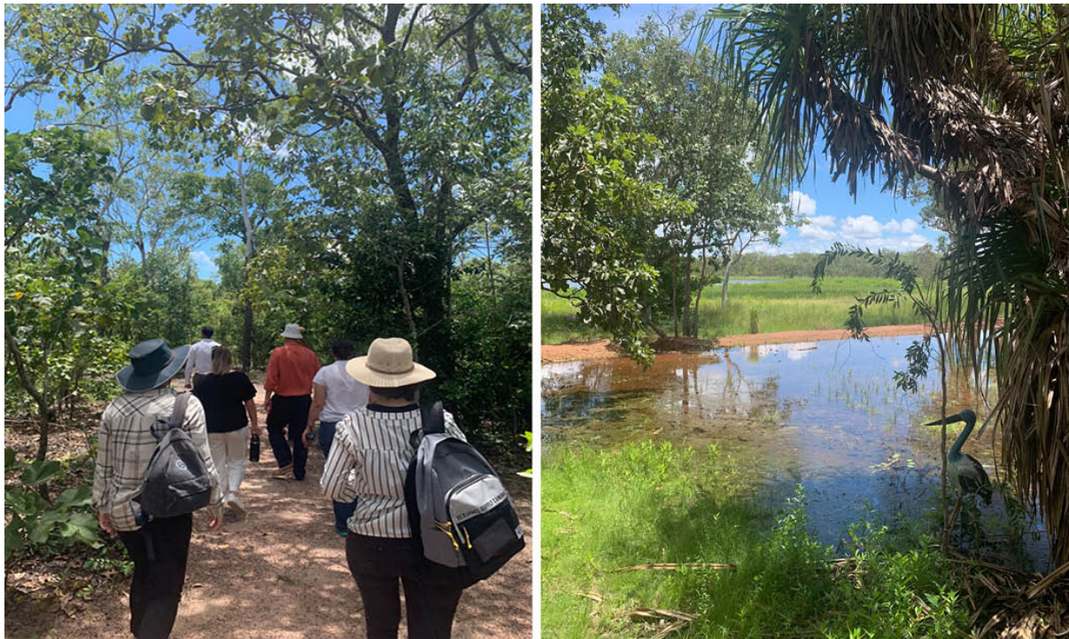
Photos from the Pudakal Cultural Tour