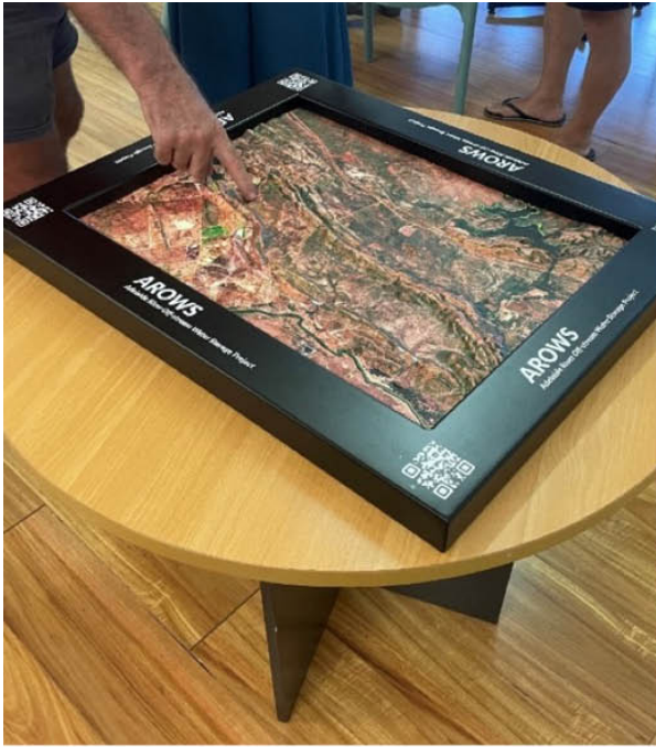
3D model of AROWS project site