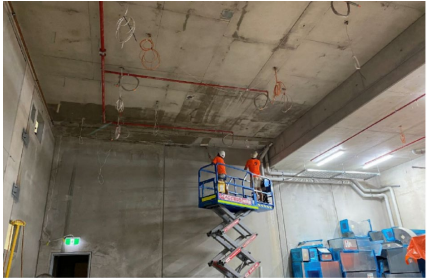
Above: A white waterproof membrane being painted on the interior walls of the car park to maintain air quality inside the gallery.

Windows will start being installed in June, along with the cooling towers.