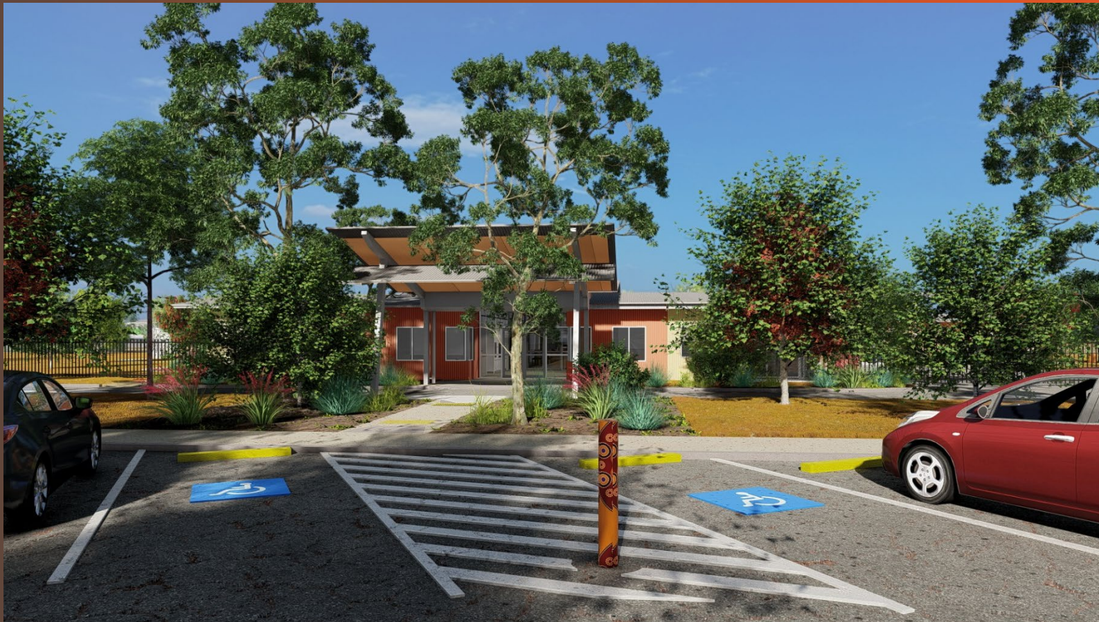
Tennant Creek Boarding Facility